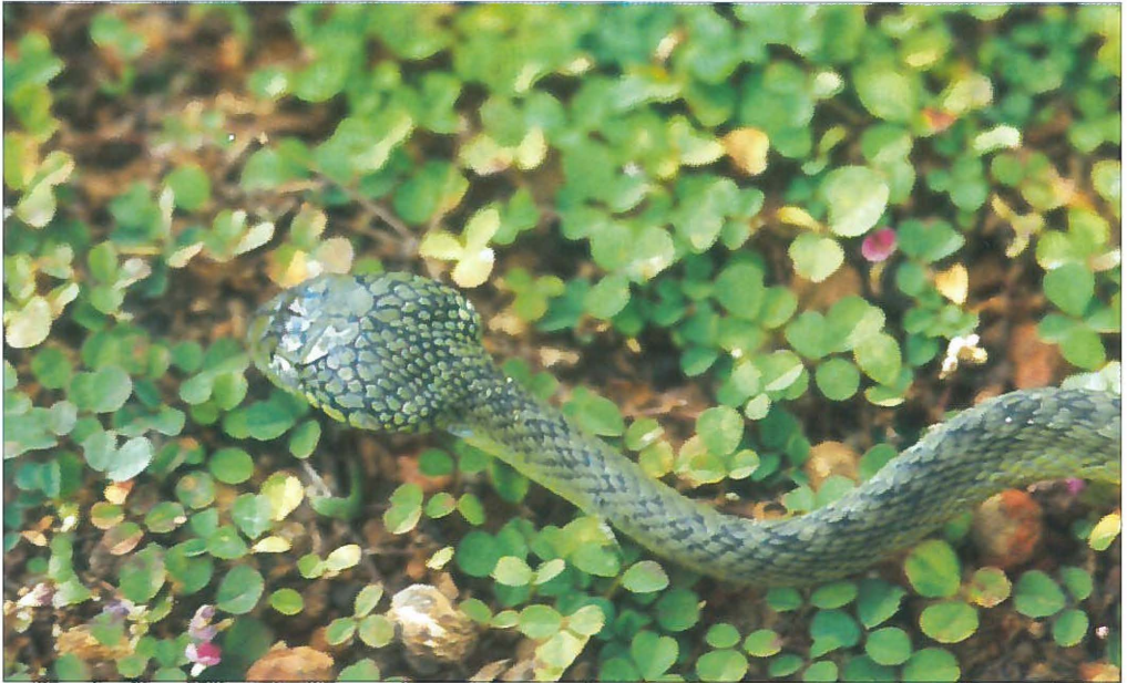
Boiga cyanea searching for food.

ground. At the break of dawn around 5.30 hours they go into hiding again.