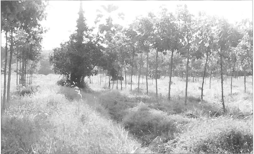
Habitat of Boiga cyanea in Suratthani.

of the journal Salamandra only one article deals with Boiga species (Golder, 1987) and in the journal Herpetofauna only three articles on Boiga were published (Neier, 1981; Bulian, 1983 and Kirschner and Abend, 1999).