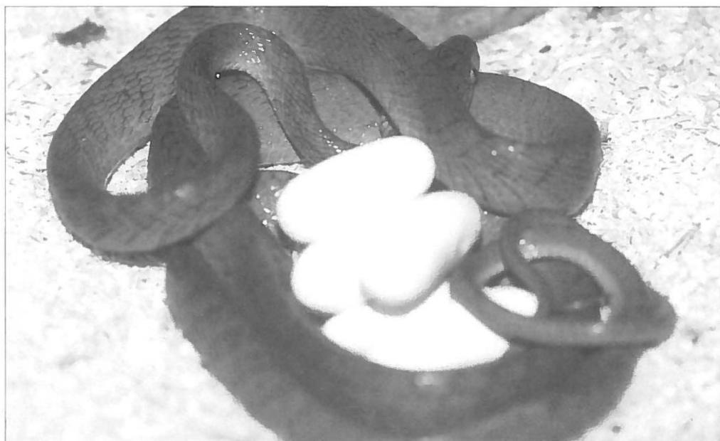
Boiga cyanea with eggs.

night, they are a more difficult prey than the sleeping Calotes . When it comes to the food of juvenile Boiga cyanea in Thailand I can only speculate. In the terrarium juvenile green cat eye vipers ate dead or alive House gecko's as well as small living skinks. I presume that in the wild these prey also represent a large part of the diet of juvenile Boiga cyanea .