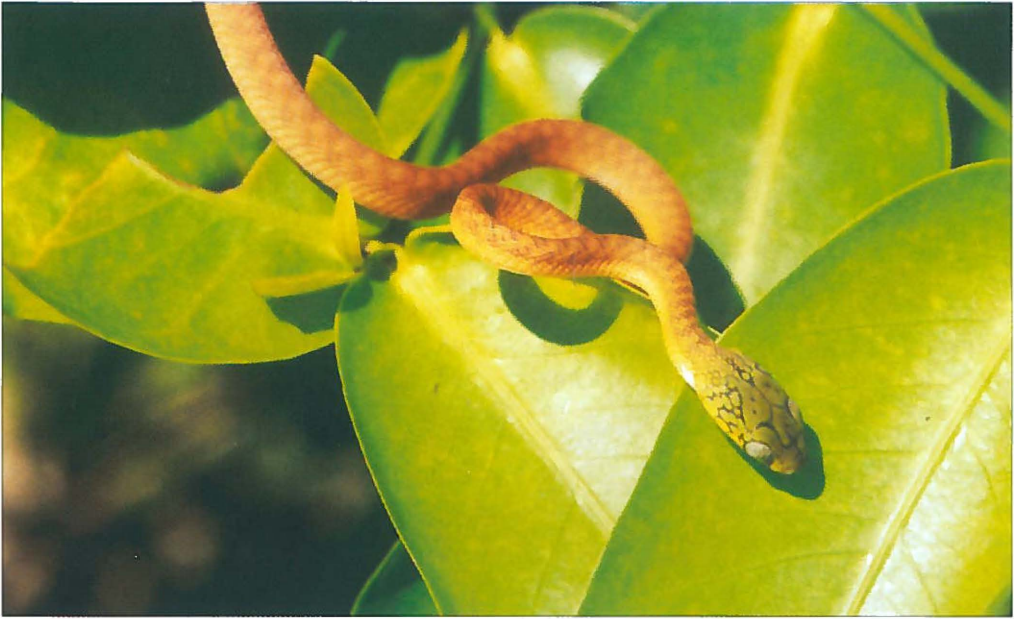
Boiga cyanea , Juvenile.

Boiga as food: 'snakes as well as birds, eggs, lizards, rats and mice'.