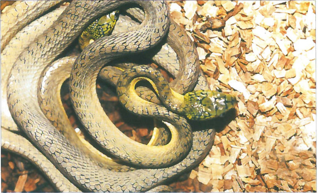
Boiga cyanea , changing her colour \pm 6 months.